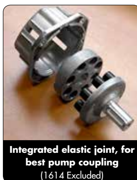
Integrated elastic joint, for best pump coupling (1614 Excluded)